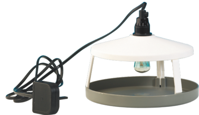
*Flea Monitoring Trap

If you think you have Fleas or have had flea treatment carried out then it is possible you are in a vulnerable area for fleas so it's important to keep on top of treatments if activity is increasing at a high rate! For this we would recommend installing monitoring traps into certain rooms for you to check each day. This will give you peace of mind as when a flea is in the room it will be attracted to our monitoring traps and then you can make us aware of the infestation. At this point we can respond accordingly in a quick turn around time to ensure we are eliminating the problem before the fleas grow and activity increases.